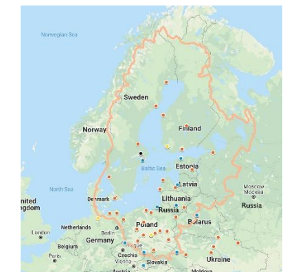
The Baltic Sea region with its drainage basin and the locations of the 84 BUP member universities.

Our aim: The main aim is to support building strong regional educational and research communities. The Programme is committed to gain and disseminate knowledge in the fields of sustainable development, environmental protection, nature resources, democracy and Education for Sustainable Development (ESD). This is achieved by developing and offering university courses, conferences, support multi- and interdisciplinary research co-operations, and by participation in transdisciplinary projects.